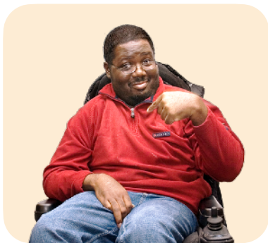
Photo ID is an official document which has a recent photo of yourself on it.